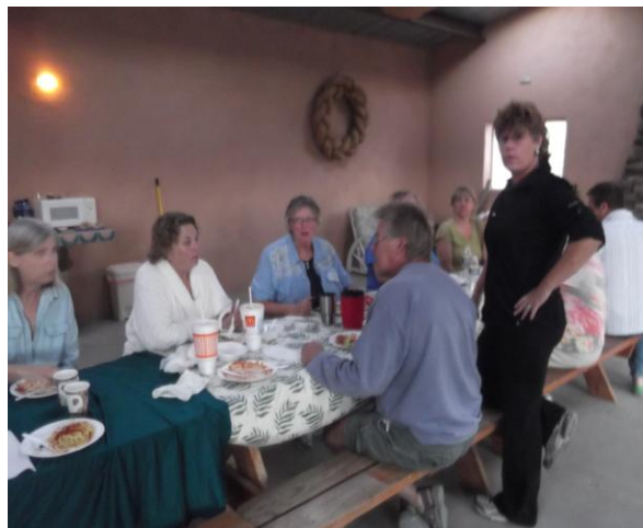
Breakfast in the Rec Hall last year

This is a pretty casual affair. The hot springs are too hot during the heat of the day, so mostly you'll find your friends there in the early morning before breakfast and after dark around 8 or 9 p.m. During the daytime, most of us like to go sightseeing. The City of Rocks is right next door for a pleasant little drive and hike. Deming has a great little museum, and southeast of Deming is the Rockhound State park. The weekend festivities in Silver City include a city-wide Art show, a world-class museum of the Mimbres culture, and the city's museum. Cool pubs and eateries add to the enjoyment. Usually people work out these trips on their own, or with friends.